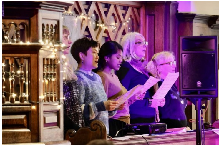
“Time for God” volunteer

The choir needs to continue to grow so that, even when numbers decline, as they always do through the year, the choir will still be a successful group taking non-musicians and reluctant musicians and welding them into a successful ensemble of enthusiastic and capable singers. There needs to be more marketing over the coming year, mostly online as this seems to be the most successful.